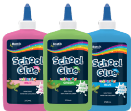
BOSTIK SCHOOL GLUE (PINK, GREEN, BLUE)